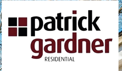
Sycamores, 6B Grosvenor Road, Langley Vale, Epsom, Surrey, KT18 6JQ